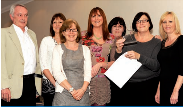
Staff at the awards ceremony

Governors joined staff to celebrate those who go the extra mile to deliver great care to patients at the 5th annual staff honours evening.